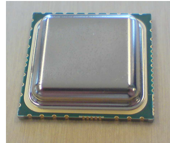
Dimensions (WxLxH) 30x38x10mm.